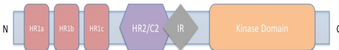
Fig. (1). Structure of protein kinase C-related kinase (PKN).

like region functions as an arachidonic acid-sensitive auto-inhibitory region (IR) [1, 24, 25, 39-42]. N-terminally truncated PKNs e.g. by caspase cleavage [18] apparently behave as constitutively-active isoforms [1, 6, 9, 25, 43-46]. In addition, PKNs were shown to be activated by various fatty acids and phospholipids in vitro , although the in vivo significance is as yet not fully characterized too [1, 6, 7, 9, 43, 44, 47, 48].