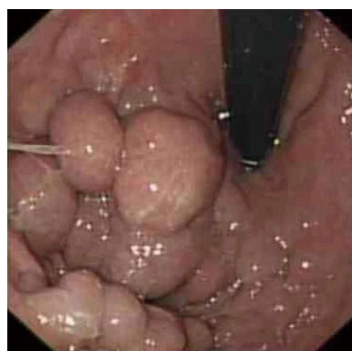
Figure 2 Endoscopic picture of isolated gastric varice-1.

cludes endoscopic band ligation, sclerotherapy and endoscopic injection of tissue adhesives or thrombin.