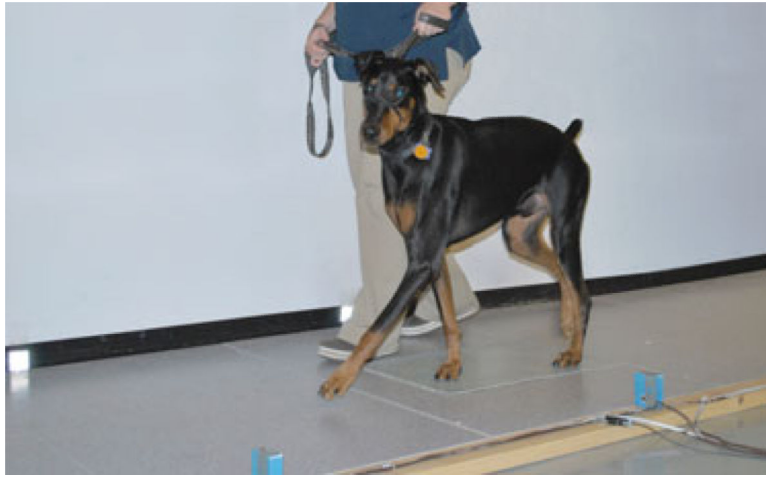
Fig 1. Force plate gait analysis in a clinically normal Doberman Pinscher.