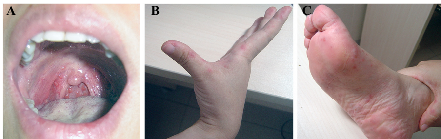
Figure 2 A typical adult HFMD patient presenting with fever, sore throat, and blister-like rash on the (A) oral mucosa, (B) hands, and (C) feet.

All adult HFMD patients in this study had herpetic lesions on the hands, feet, or oral mucosa. However, not all of them had fever, and none had severe complications. Few patients had white blood cell counts over 10,000/ \mu\text{L} , and none had X-ray-confirmed pneumonia.