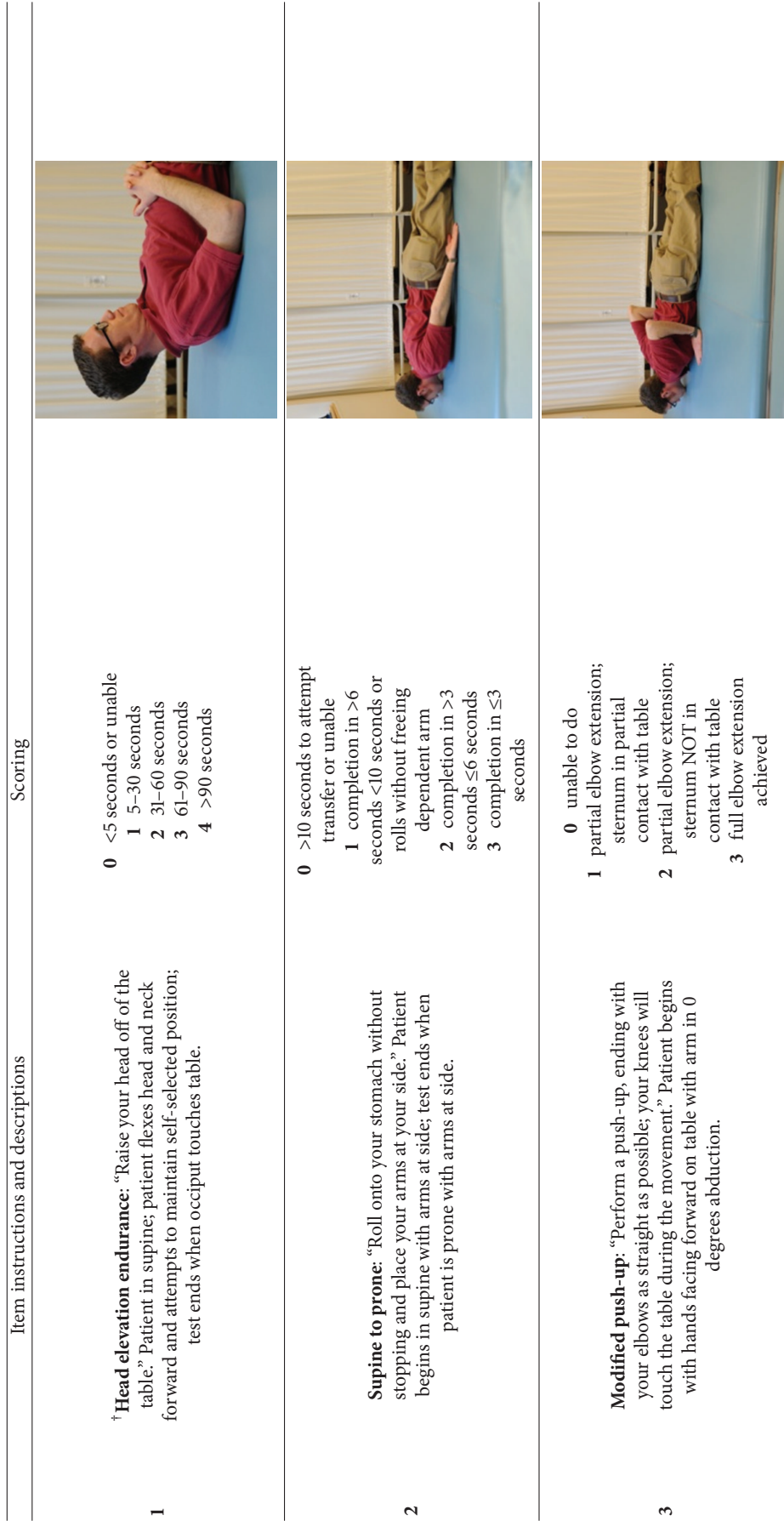
TABLE 6: The adult myopathy assessment tool (AMAT).