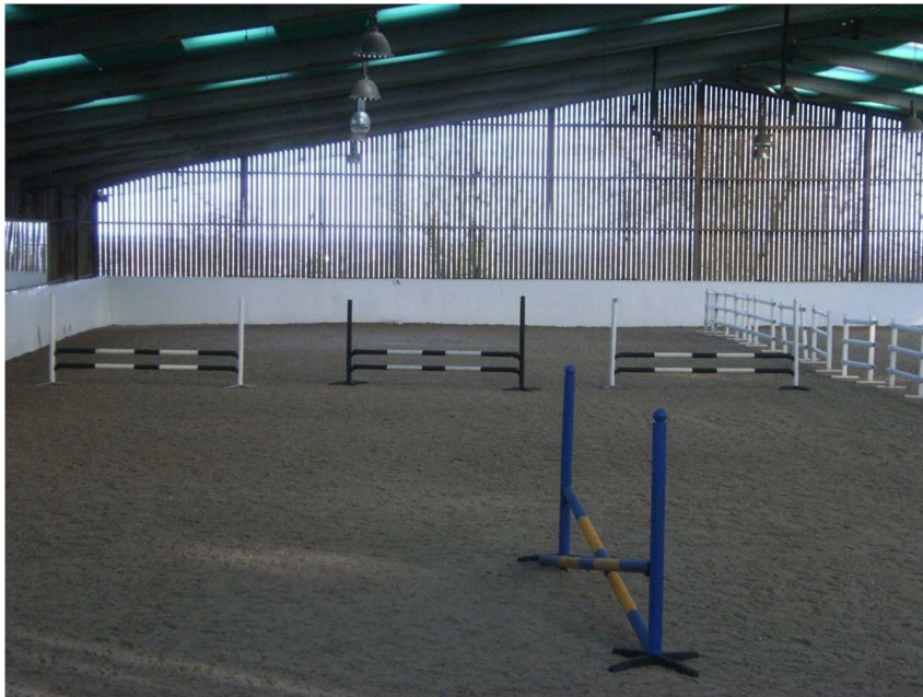
Figure 1. Test arena, course of 3 trial jumps and practice jump. The test area, three trial jumps and the practice jump are shown. The blue and yellow jump in the foreground was used as the practice jump. The course was approached from this end with the jump on the left being jumped first, followed by a right turn across the diagonal (jump 2) and then a left turn to approach jump 3 (adjacent to the white barriers). doi:10.1371/journal.pone.0097345.g001

(RMU) to a digital video cassette recorder (DVCR) housed in a backpack worn by the rider. The ASL Mobile Eye recorded data at 60 Hz by interleaving images taken from the two cameras. The eye camera recorded the eye being tracked whilst the scene camera recorded the environment being observed by the wearer. Both image streams were recorded on the same digital videotape medium by alternating frames and position of gaze (POG) was shown by a red cursor and was recorded every frame of video or 33.33 milliseconds. A purple circle appeared within the frame and indicated that the pupil had been identified [13]. See Figure 2 for an example of scene camera/POG cursor as recorded during these