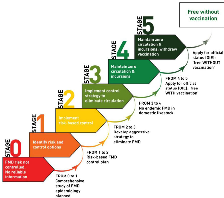
Figure 3 The FAO/EuFMD/OIE Progressive Control Pathway for FMD. The status of countries on the PCP-FMD is evaluated according to defined criteria. Countries with endemic disease are in stages 0 to 3 while countries with no endemic disease within livestock are at stage 4 or above.

required to achieve the outcomes have, however, not been prescribed. This non-prescriptive approach has the advantage that each country can adopt an approach according to its national/regional requirements and capabilities to achieve the outcomes. Understanding the “local” epidemiology of FMD and the active monitoring of the virus circulation are the foundations of the PCP-FMD and activities to meet these requirements are required in all stages [96]. Determination of the factors responsible for maintenance and spread of the disease and knowledge about circulating subtypes of FMDV are essential for effective control of the disease.