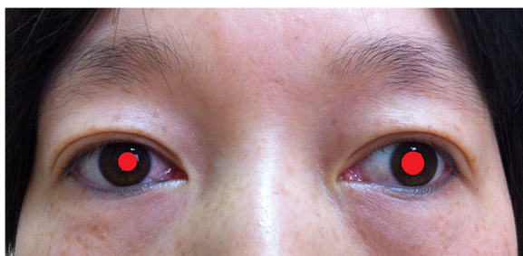
Figure 2 Horner's syndrome (4 months post surgery).

Now, VAT is an alternative to conventional surgery due to its minimal invasiveness. In VAT, however, the small incision on the neck may need to be retracted more forcefully in order to expose the carotid sheath laterally. Theoretically, this may lead to higher incidences of postoperative Horner's syndrome. The incidence of Horner's syndrome was around 0.2% after conventional surgery [3]. However, until recently, the incidence of Horner's syndrome was largely unknown after VAT. From 2011 to 2012, 537 cases of VAT were performed in our department. Two cases of postoperative Horner's syndrome occurred (0.4%). According to the literature, [6,7] there were no statistically significant differences between VAT and conventional thyroidectomy for complications, such as transient recurrent laryngeal nerve palsy and hypoparathyroidism. In our study, the incidence of postoperative Horner's syndrome was relatively higher in VAT. However,