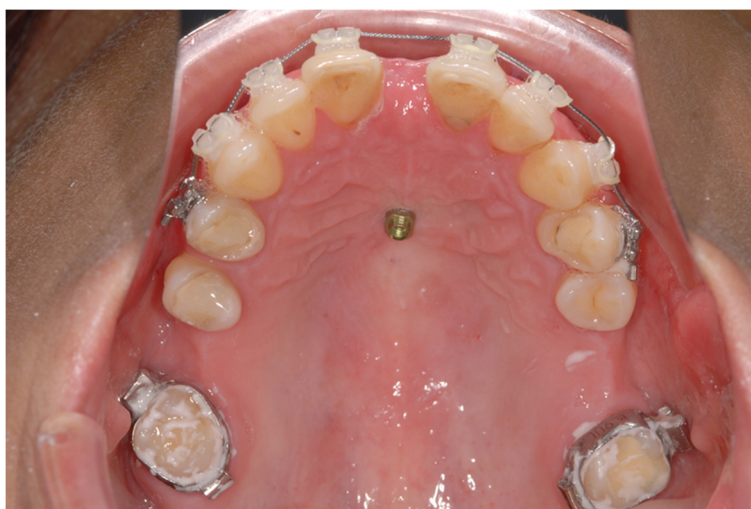
Figure 1 2 × 11 mm mini-implant inserted in the median part of the anterior palate between the second and third palatine rugae.

Benefit mini-implants (length: 11 mm, outer diameter: 2 mm, inner diameter: 1.35 mm, thread pitch: 0.75 mm)