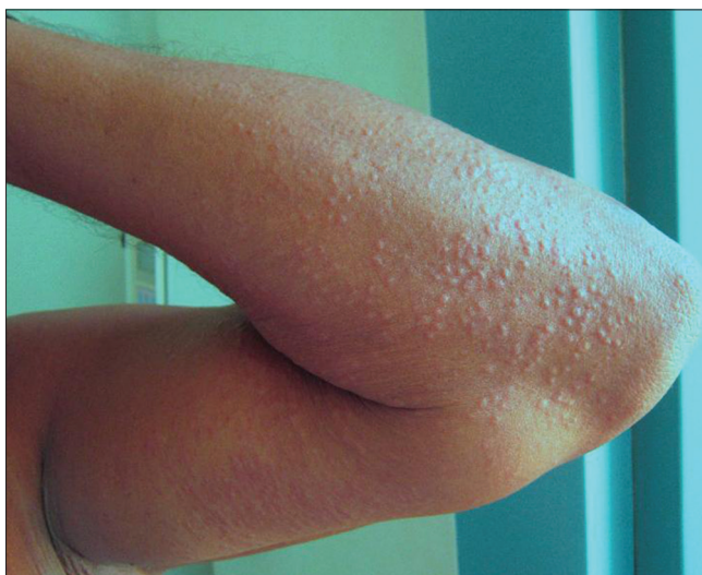
Figure 1: Multiple papules on the forearm

Malakar and Dhar [8] reported spontaneous resolution of vitiligo patches distant from autologous skin graft site and used the term remote reverse Koebner's phenomenon. In our case also lesions distant from the biopsied site resolved spontaneously. Further research is warranted regarding the presence of remote