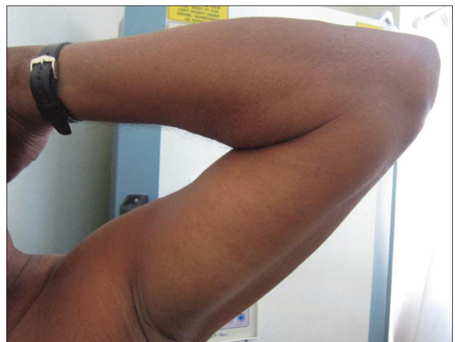
Figure 2: Lesions resolved after biopsy