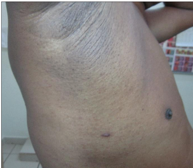
Figure 4: Biopsy scar mark on the lateral part of chest

reverse Koebner's phenomenon in the interstitial variant of generalized granuloma annulare.