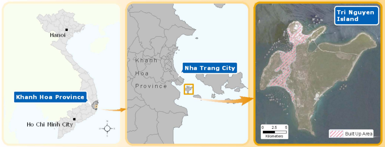
Figure 1. Map of study region. Tri Nguyen Island, Khanh Hoa Province, Central Vietnam. doi:10.1371/journal.pntd.0002794.g001

part because of their emphasis on context and their documentation of knowledge and attitudes in a given geopolitical setting. In this study, key or recurring themes from the qualitative research were explored further using quantitative measures (a household survey and anonymous questionnaire) and results were triangulated (compared, challenged or confirmed) across different methods: interviews, observations, questionnaires and a series of community meetings and workshops - styled on a focus group. Importantly, the findings presented here should not be seen as isolated research activities, but as a body of interconnected data developed over time using iterative processes and then contextualized, triangulated and crosschecked. An overview of the research activities undertaken at each phase, the issues they explored, how participants were recruited and the outputs they produced, is provided in Table 1.