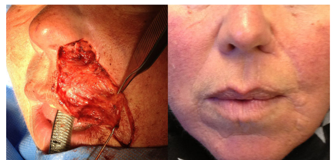
Fig. 5 Combined reconstruction of ala with a propeller NL flap and a V-Y advancement reconstruction of the upper lip and nasal floor; 6 months result after a minor revision

The nasolabial flap, and glabellar and forehead flaps are well described as axial pattern flaps on a narrow pedicle or as island flaps [1]. Since then, the knowledge of a perforator-based design evolved from the angiosomal concept introduced by Taylor and Palmer in 1987 [4]. In the year 2000, Dr. Taylor's team published a study on the facial angiosomes, which is the basis of the flap design which we have used in this series of flaps [5]. The facial artery perforator flap, which we used in