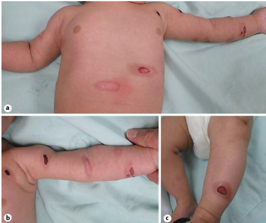
Fig. 1. a Erosions on the chest and left arm. b Hemorrhagic blisters with crusts suggestive of EB. Note the presence of erythema around the maculas after the friction characteristic of Darier's sign. c Ulcer of the left leg, 127 × 101 mm (300 × 300 DPI).