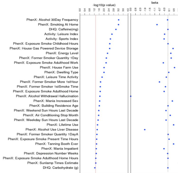
Figure 1. The most significant association results in the Marshfield sample using PhenX Toolkit, DHQ, and Measurement of a Person's Habitual Physical Activity surveys

The PhenX variables are listed along the Y-Axis. The first track shows the results of our EWAS, with -\log(10) of the p-value plotted from most significant result at the top and descending in order. The next track shows the magnitude and direction of the effect. Case/control status was coded as 1=Control, 2=Case.