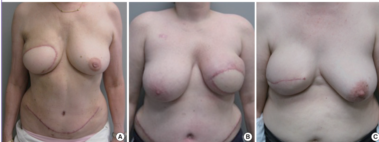
Fig. 2. Delayed reconstruction

Frontal photographs taken six-months following delayed-immediate reconstructions prior to nipple reconstruction for patients who received the highest (A), average (B), and lowest (C) scores within this cohort.