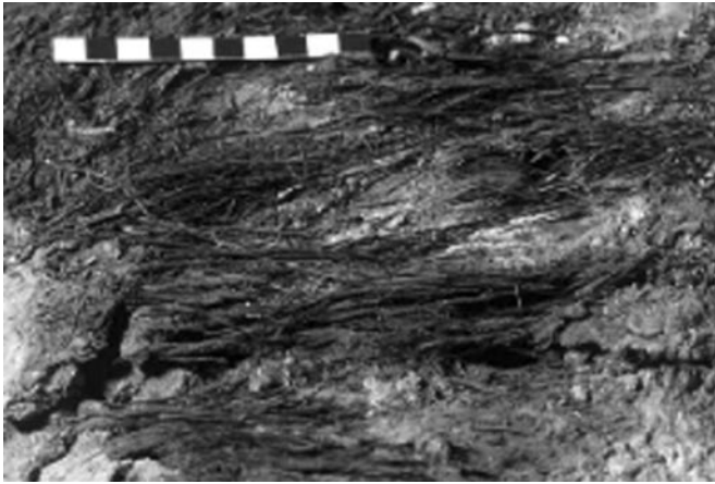
Fig. 3. Grass bedding, in situ , on the bottom floor of brush hut 1 during excavation (scale in cm).

pattern, although the fragmentary nature does not permit a conclusive statement.