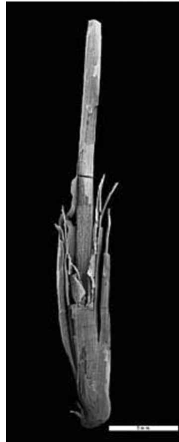
Fig. 4. Micrograph of a Puccinellia confer convoluta shoot with the basal part of the flowering stem crowded by open leaf sheaths. Visible on both sides are the short narrow outer leaf sheaths. The uppermost sheaths firmly clasp the peduncle with their overlapping margins, and some leaf sheaths still retain their scabridulous margins. The fibrous roots are missing.

Two tentative explanations for the origin of the substance are offered at present. It is possible that hides or furs were placed on top of the grass cover, and while the hut was burning, fats or other organic compounds were melted and then embedded with clay in-between and especially over the grasses, creating the