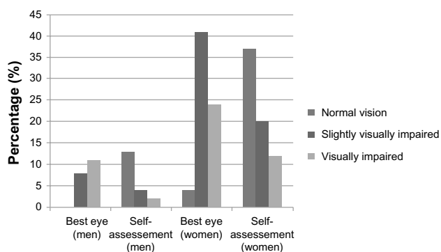
Figure 2 Measured visual acuity and the self-assessment of the visual function, measured in percentage.

Five of the 93 participants could not see any of the letters at all on the LogMAR chart at a range of either 6 m or 4 m. Of the remaining 88 participants, five were blind in their right and three in their left eye. The VA distribution of the best eye of the participants was identified and is shown in Table 3 and