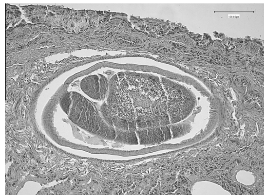
Fig. 2. Lung: adult nematode within a pulmonary artery. Hematoxylin and eosin. Scale bar represents 100 µm.