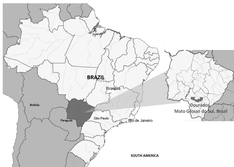
Figure 1 Map of Localization of Dourados, Brazil.

The diagnosis of TB is accomplished by smear, culture, and X-rays [23]. The BHU offers pots for indigenous people to collect sputum and directs patients to the