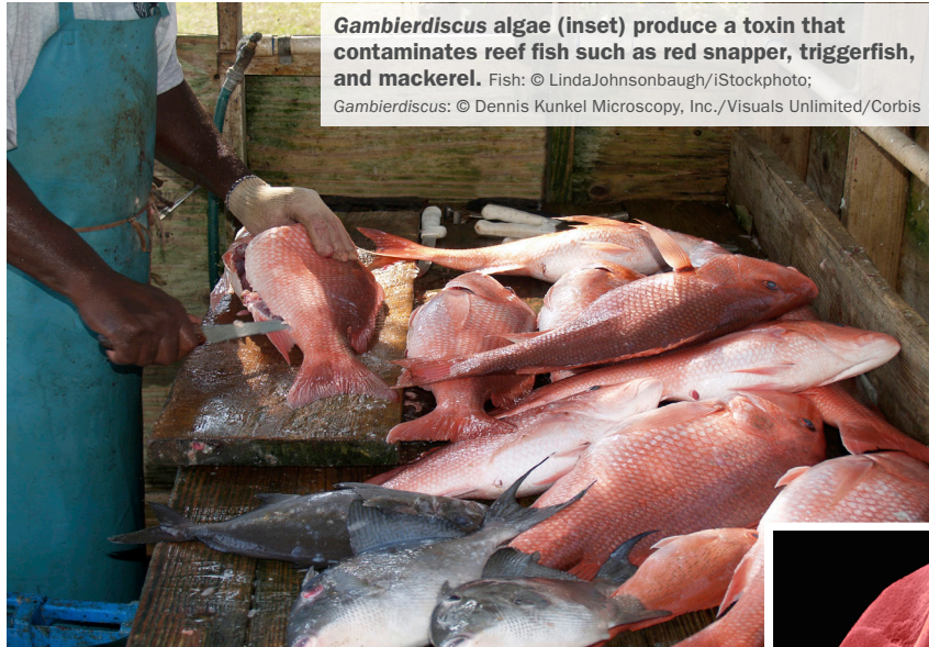
Gambierdiscus algae (inset) produce a toxin that contaminates reef fish such as red snapper, triggerfish, and mackerel. Fish: © LindaJohnsonbaugh/iStockphoto; Gambierdiscus : © Dennis Kunkel Microscopy, Inc./Visuals Unlimited/Corbis

Ciguatera fish poisoning (CFP), the most common nonbacterial illness linked with eating fish, arises from the ciguatoxin produced by Gambierdiscus algae in tropical and subtropical areas of the Pacific, Western Atlantic, and Indian oceans. 1 In this issue of EHP investigators assess the relationship between climate variability and reports of CFP,