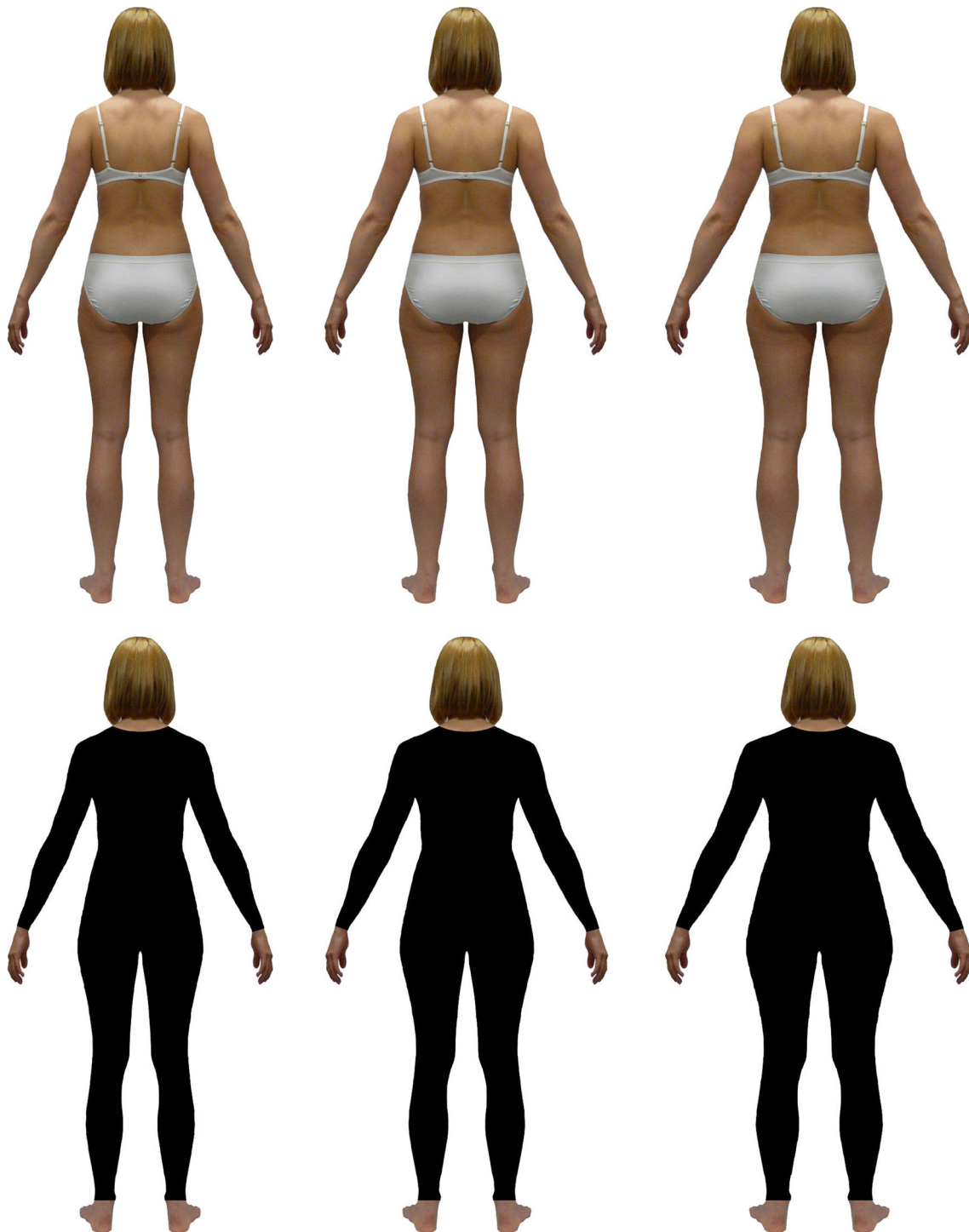
Fig. 2 Color ( top ) and black ( bottom ) versions of silhouettes representing women with typical body proportions but diversified in body mass: light ( left ), average ( middle ), and heavy ( right ), corresponding to body

mass index of 18.5, 21, and 25. Each silhouette was further digitally manipulated to produce figures varying in WHR (Color figure online)