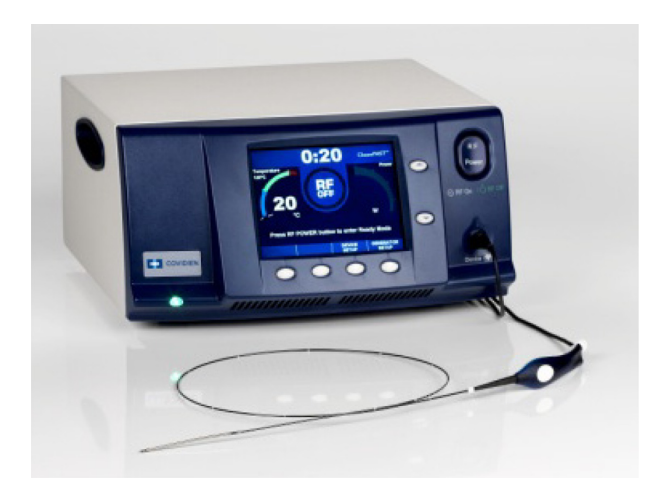
Figure 3 Image of the Closure Fast<sup>™</sup> catheter (ClosureFAST, Covidien, Dublin, Ireland) connected to the Venefit<sup>™</sup> Generator.

on the catheter (7 cm or 3 cm, respectively) and energy is then applied to the next section. In this way, a typical great saphenous vein can be treated in under 3 minutes (49 cm takes 7 \times 20 seconds =140 seconds) without the operator having to withdraw the catheter at a steady rate as is required for laser ablation or the Celon system. It is therefore very easy to use. Ultrasound examination of the vein wall normally demonstrates that it is thickened and more echogenic than before the procedure with a smaller total vein diameter. This normally indicates successful treatment. Double treatment of each 7 cm section has been suggested to improve outcomes but one small study of 67 treatments showed no benefit at 1 year, although the reduction in diameter was greater.