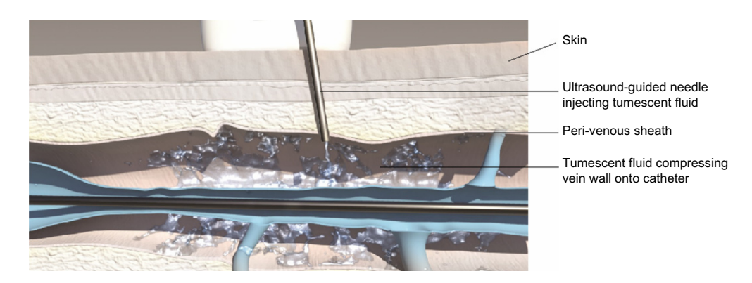
Figure 2 Diagram showing the injection of tumescent fluid, using ultrasound control, into the perivenous sheath in order to compress the vein wall onto the Closure Fast<sup>TM</sup> catheter (ClosureFAST, Covidien, Dublin, Ireland).

Once tumescent anesthesia has been correctly infused into the patient's leg, the catheter is then attached to a generator (Figure 3), which, when switched on, delivers the radiofrequency energy. Each section of vein (7 cm or 3 cm) is heated for 20 seconds before the energy is automatically switched off. The catheter is then manually withdrawn to the next marker