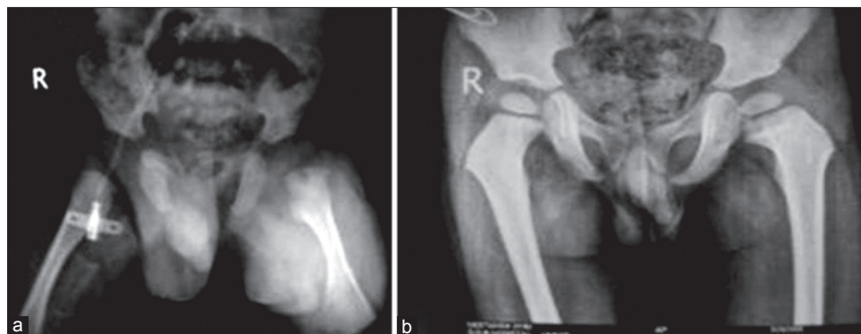
Figure 1: (Case 1) - X-ray pelvis both hip joints anteroposterior view showing (a) left hip subluxation, osteomyelitis upper end femur left side (b) followup at 2 years and 8 months. There is appearance of capital femoral epiphysis on both sides and coxa magna left side

The child was taken up for aspiration and drainage of the left hip and repeat aspiration of left knee. Purulent fluid was obtained on aspiration of the knee and on arthrotomy of the hip joint. The pus as well as the synovial tissue was sent for culture. Pus culture and tissue culture from the hip was negative for any growth as was the aspirate from the knee.