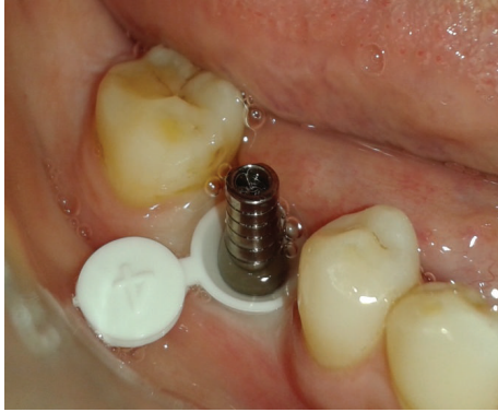
FIGURE 5: Abutment along with G-cuff.