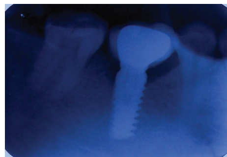
FIGURE 12: IOPA after one-year.