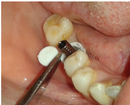
FIGURE 6: Extraportion cut with scissor.