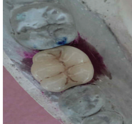
FIGURE 9: Definitive crown.