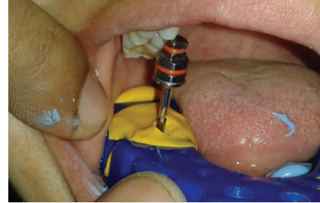
FIGURE 17: Coping screw removed.