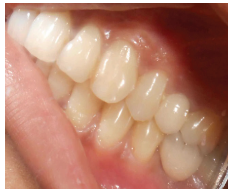
FIGURE 10: Cementation of crown.