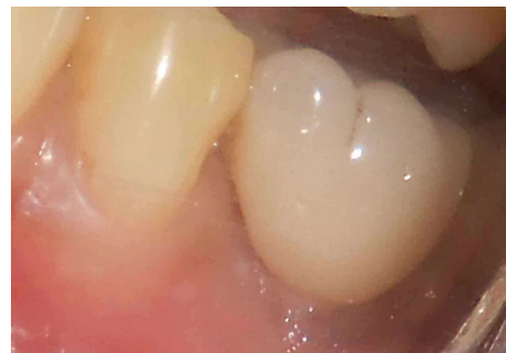
FIGURE 11: Emergence profile of crown.