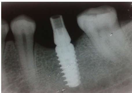
FIGURE 7: IOPA of implant-abutment assembly.