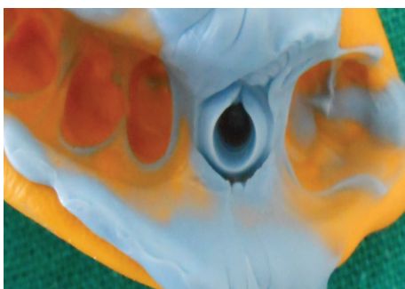
FIGURE 8: PVS impression.