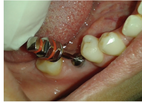
FIGURE 1: Healing abutment removed.

The utmost care is needed while doing implant transfer to obtain master casts and also while achieving a passive fit of the prosthetic superstructure to the implant to maintain the osseointegration around the implant [14–19]. Eames et al. [20] suggested the importance of impression procedures to obtain suitable and reliable prosthetic superstructures, which can be achieved with the following steps: impression, cast acquisition, waxing, embedding, and casting. Numerous techniques of implant transfer are reported, but its accuracy