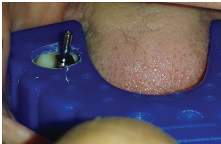
FIGURE 14: Window prepared in the tray.