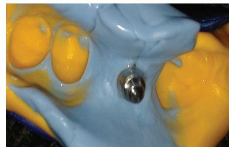
FIGURE 18: PVS impression without G-Cuff.