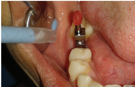
FIGURE 15: Coping screw blocked with wax.