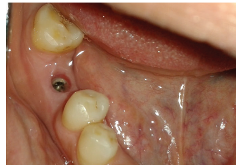
FIGURE 2: Implant with surrounding tissue.