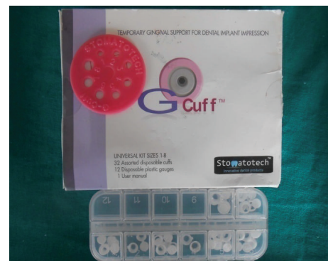
FIGURE 3: G-Cuff kit.