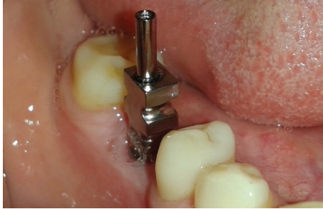
FIGURE 13: Transfer coping attached.