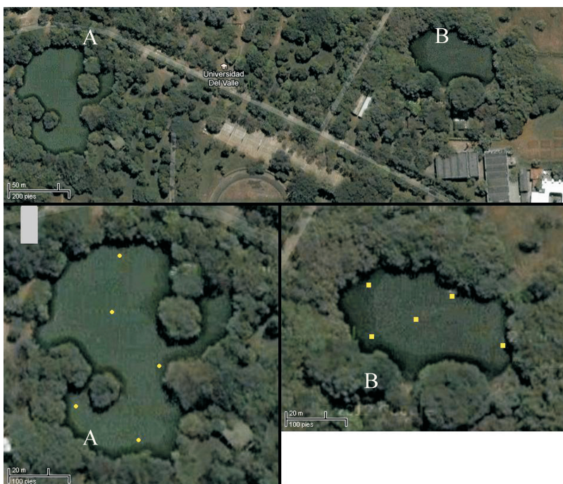
Figure 1 - Satellite image of the lakes and location of the sampling sites. Central Lake (A); Estación Lake (B).

The yeasts were chosen for isolation based on colony morphology. Yeast CFUs were registered for quantitative analysis of yeast occurrence during the third day of incubation. All the isolates were preserved in GPY broth supple-