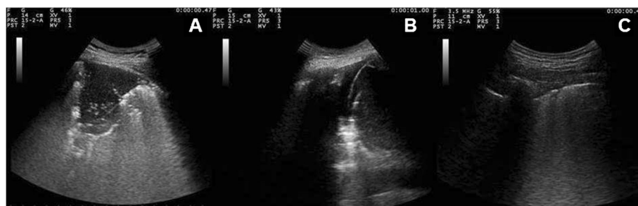
Figure 1 Chest ultrasonographic patterns: lung consolidation (A), pleural effusion (B) and sonographic interstitial syndrome (C).

As already reported in literature, the use of radiation for diagnostic imaging in pregnant women is associated