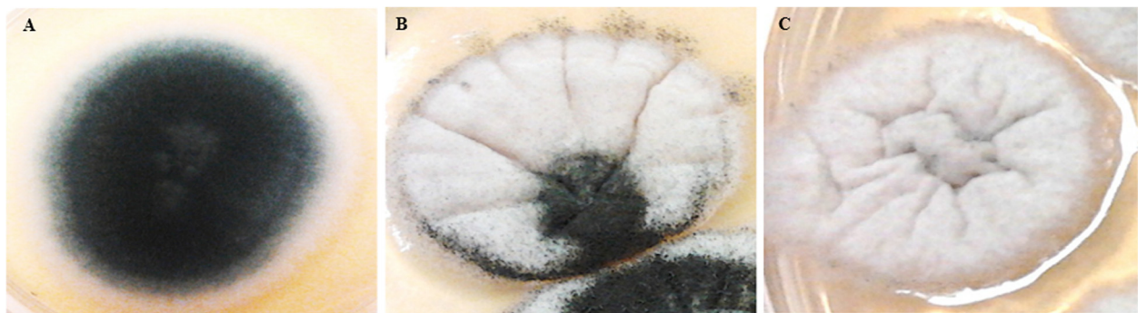
Figure 1 Photographs of Sabouraud dextrose agar plates showing macroscopic morphological changes of colonies of A. fumigatus following exposure to subinhibitory concentration of PCZ. A. Initial morphological aspect (control). B. After fifteen days. C. After thirty days.

such resistance [15-17]. A clonal expansion of isolates harbouring the TR34/L98H mutation has been reported across several countries [15-18]. Interestingly, besides the fact that these resistant isolates are less genetically variable than susceptible ones, no impact on fitness was observed [18]. The phenotypic results (Figures 1 and 2) and the stability of the developed resistance (Table 1) herein reported suggest the same. Future studies aiming to assess the underlying molecular resistance mechanisms, not only from these induced resistant strains but also from isolates with naturally high MIC values to PCZ and resistant to medical azoles without previous in vitro induction, will certainly be our next step. Meanwhile, our study suggests that the abuse of azole antifungals in nature may cause serious human health problems since azole-resistance and cross-resistance has the potential to further compromise the efficacy of clinical azoles in the future [4,17-20]. Furthermore, we can speculate that the exposure of clinically relevant moulds other than A. fumigatus to agricultural azoles may also be associated with the emergence of cross-resistance to clinical azoles. Several compounds are being tested in order to