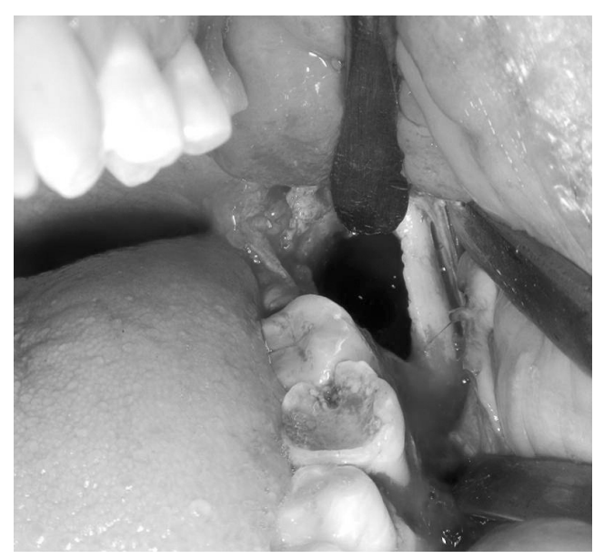
Figure 2 - Intraoperative appearance of the surgical field after removal of the lesion.

tom of the alveolus. The mass was processed for histopathological examination, which confirmed the diagnosis of osteoma. Immediate postoperative wound healing was satisfactory, radiological check up was obtained ten days postoperatively (Figure 3) and at one year follow-up the patient was totally asymptomatic and the area of interest appeared to be healed in a satisfactory way both at clinical and radiological examination. No symptoms or signs of neurosensory impairment to the innervated area neither of the inferior alveolar nerve or the lingual nerve could be detected.