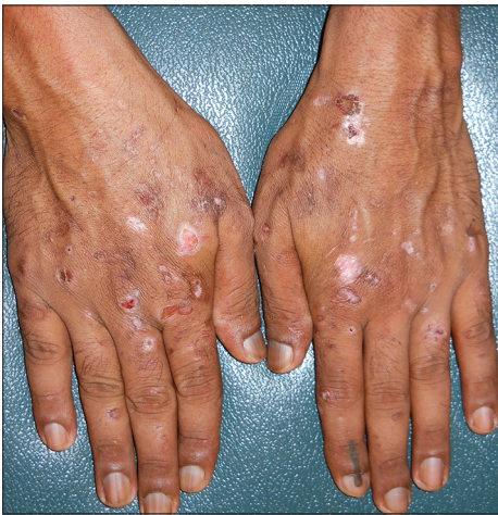
Figure 1: Clinical photograph showing multiple erosions with crusts and scars over the dorsum of both hands

Mansourati et al. initially reported the association of PCT with HIV in 1987. They reviewed 75 reported cases of HIV infection with PCT; almost all (96%) of the patients were male. At the time of diagnosis, the mean age was 36.5 years and the mean CD4 count of 166 cells/mm 3 . Forty-five percent of the patients had hepatitis C virus infection, 55% consumed alcohol heavily, and 89% had abnormal liver function test results. The diagnosis of PCT preceded the detection of HIV infection in 40% of cases. [2] Clinical features of PCT appeared prior to the detection of HIV infection in our patient with no evidence of