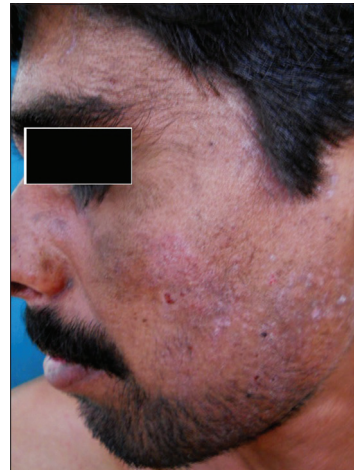
Figure 2: Minimal hypertrichosis and erosions with crusts over the left side of the face