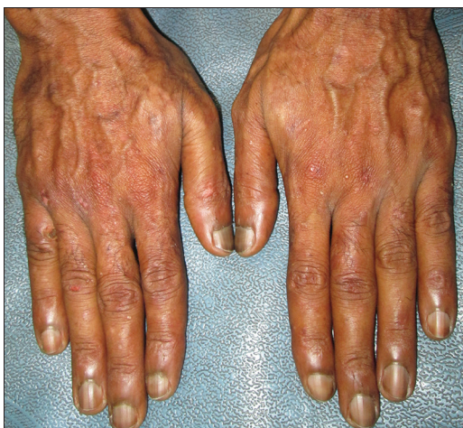
Figure 5: Resolution of the erosions over the dorsum of both hands

polycythemia and late cutaneous manifestations of PCT.