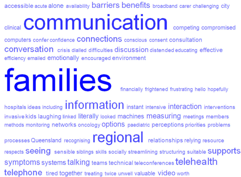
Figure 2 Tag Cloud of word frequency from interviews.

with time, once the program was fully integrated with the service. This has not been observed; utilisation has continued to decline over time rather than grow. Given the complexities of care and the multiple other interventions required, it may be that utilisation of the program is appropriate for only a small number of patients. Potentially, the original expectations for use may have been too high. As the PPCS has grown and developed as a service, it has established a network of primary care clinicians in the community, and through education, has increased their capacity to provide direct care. Thus it may be there is a reduced requirement for the PPCS to be directly involved with families and therefore less need for home telehealth in this specific population.