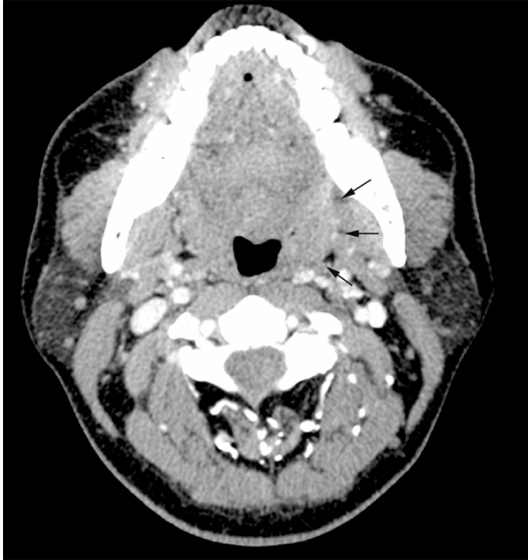
Figure 1. CT scan shows the contrast-enhancing mass originating from the left tonsil (arrows).

Contrast-enhanced computed tomography (CT) scan of the neck showed a 3.4 × 1.8 cm tumor with moderate enhancement in the left tonsil. Bilateral lymphadenopathy was also observed with the imaging study and a 1.3 cm × 1.0 cm left internal jugular node was the largest one ( Figure 1 ). In addition, chest, brain and abdominal CT scans were performed and indicated there were no other lesions. Thus the left palatine tonsil was confirmed as the primary lesion and there was no evidence of distant metastasis. A biopsy of the tonsillar mass was then performed under local anesthesia. Histologic examination revealed small round to oval tumor cells were arranged in cords or nests, containing hyperchromatic nuclei and scant cytoplasm. Mitotic figures were readily identified. Immunohistochemical staining showed that tumor cells were strongly positive for neural cell adhesion molecule (CD56), focally positive for pancyokeratin (PCK) and negative for leukocyte common antigen (LCA) ( Figure 2 ). The patient was diagnosed as primary small cell NEC of the left tonsil.