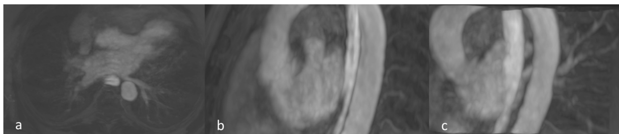
Figure 1 MRA of a 66 years old male with AF. MIP reconstruction in post-processing of MRA images acquired using both venous and oral Gadobenate Dimeglumine, 24 hr before percutaneous catheter ablation: (a) Axial MIP reconstruction (b) Left sagittal 3D MIP reconstruction (c) Left-Posterior 3D MIP reconstruction.

Pavone et al. first performed a MR scan with barium paste and the MR contrast agent, gadopentetate dimeglumine, to visualise the oesophageal lumen in patients with oesophageal stenosis [20]. MRA, besides providing detailed and complete imaging of the complex LA anatomy, does not expose the patient to ionising radiation [21]. Pollak et al. performed MRA with barium paste and gadopentetate dimeglumine in four candidates for RFCA; in one patient, the contrast agent passed to the stomach without enabling visualisation of the oesophagus [22]. A MRA scan is usually of longer duration than CT, and swallowing a contrast medium bolus at the correct time during a long breath-hold period could be difficult for the patient. In this study, using R-L phase encoding the