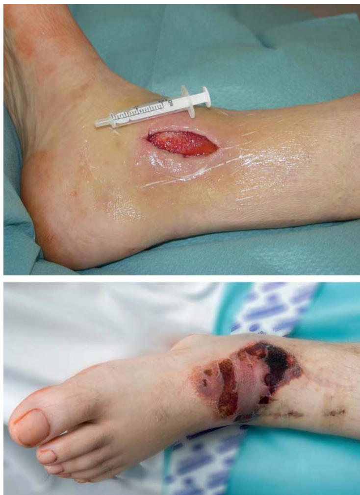
Figure 3: Ulcerative tissue defects due to pressure from within in longstanding, untreated, non-repositioned ankle fractures

Every ankle fracture is, by definition, a joint fracture. The goals of surgery are, therefore, always the smooth anatomical reconstruction of the joint