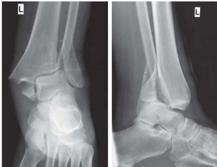
Figure 2: A dislocated ankle fracture (x-rays in two planes)