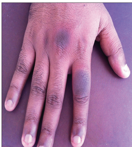
Figure 1: Fixed drug eruption in the form of erythematous plaques on the dorsal aspect of the right index finger and the base of the right middle finger

was conducted 4 weeks later, each drug of the three drugs being tested separately 2 weeks apart. Patient tolerated amoxicillin and lansoprazole without any adverse effects. However following challenge with oral clarithromycin, the patient developed similar skin changes 2 h after intake, hence supporting the diagnosis of FDE secondary to clarithromycin. Patient refused skin biopsy for further confirmation. We counseled him regarding the nature of the drug reaction and recommended avoidance of clarithromycin in future.