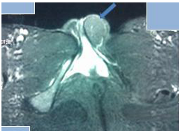
Figure 2 Axial T2-weighted, fat-suppressed magnetic resonance image. Markedly decreased signal intensity of the mass is found (arrow).

Lipomas usually present as single or multiple painless slowly growing and mobile swelling soft tissue with a pasty characteristic. The tumor shows ill-defined, well-demarcated, or pedunculated aspects that are not adherent to the overlying skin. These characteristics allow correct diagnosis in most cases by clinical examination [1-6]. However, vulvar lipomas have to be differentiated from