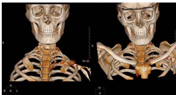
[Table/Fig-1 a&b]: 3D CT images showing bilateral cervical ribs with pseudoarthrosis on the rightside

CT scan of the neck was done using the Phillips Brilliance 128 slice CT Scanner. Multiplanar & 3D reconstructions were done in the workstation. CT scan revealed Bilateral partial cervical ribs. The right cervical rib showed a pseudoarthrosis with the 1 st thoracic rib on the right side [Table/Fig-1 a,b]. An accessory bone was also present at the articulation site with minimal soft tissue [Table/Fig-2]. There was