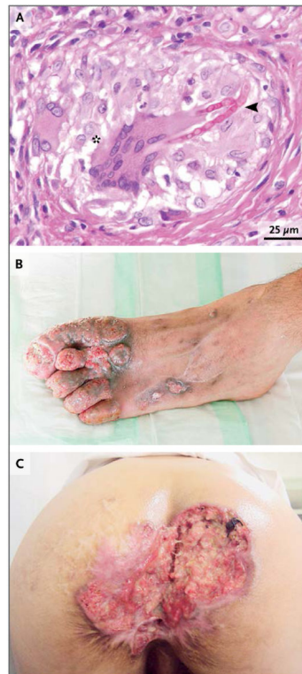
Figure 2. Clinical and Histologic Features of Patients with CARD9 Deficiency

A skin-biopsy specimen from Patient 13 (Panel A, periodic acid–Schiff) shows irregularly branched septate hyphae (arrowhead) in the center of a granuloma containing multinucleated giant cells (asterisk). Clinical features of Patient 12 (Panel B) and Patient 8 (Panel C) are shown.