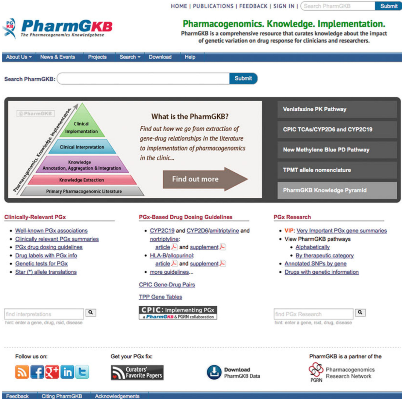
Fig. 1. The PharmGKB homepage, http://www.pharmgkb.org , contains directed search boxes where users can also browse from lists of genes, variants, drugs, or diseases