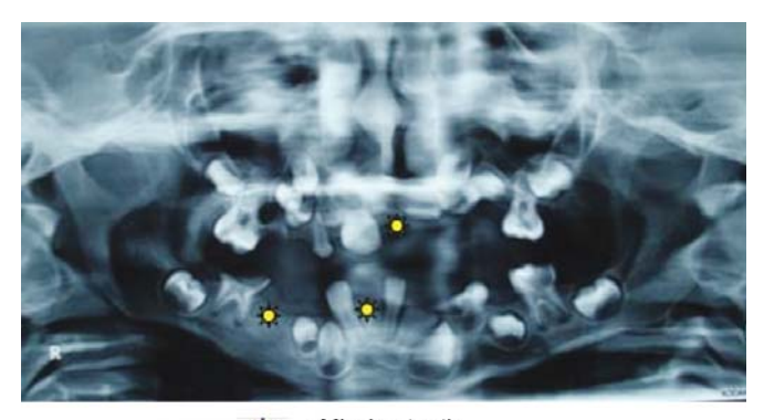
Fig. 5: Orthopantomograph showing hypodontia

dysplasia patients, but as nerve conduction test results in our patient were normal, it was diagnosed as self injurious habit. Patient was sent to a psychiatrist for psychological counseling.