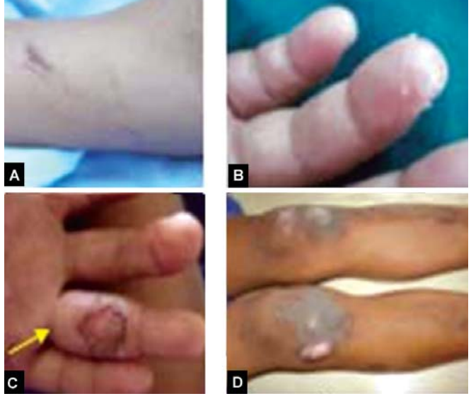
Figs 2A to D: Self mutilation (A) Scratch marks over his hands, (B) Peeling of skin in fingers, (C and D) Burn marks on his palm and legs

whereas palate was normal. Following teeth were present (Figs 4A and B): 16, 55, 53, 11, 26, 31, 34, 36, 42 and 46. Parents were not aware of his missing primary teeth during primary dentition period. Radiographic evaluation by an orthopantomograph confirmed hypodontia with missing 21, 45, 41 and presence of tooth buds of remaining teeth with delayed root formation (Fig. 5).