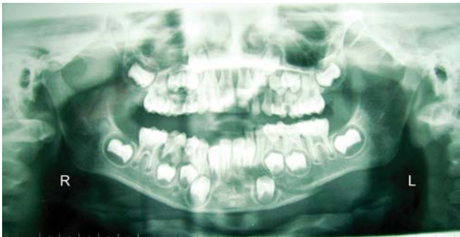
Fig. 4: Left parasymphysis fracture