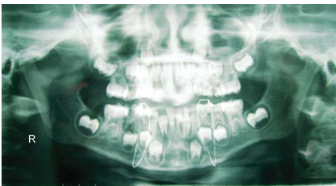
Fig. 5: Circummandibular wiring for acrylic occlusal splint