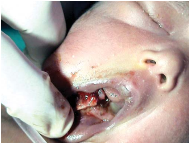
Fig. 2: Preoperative photograph showing displaced fracture

fractures become difficult to reduce by seventh day. 5 This results in need for different forms of fixation as early as possible for comparatively shorter duration of time. Nonunion or fibrous union rarely occurs in children and excellent remodeling occurs under the influence of masticatory stresses even when there is imperfect apposition of bone surfaces. The management of mandibular fractures in children differs somewhat from that of adults mainly because of concern for possible disruption of growth. In children the final result is determined not merely by initial treatment but by the effect that growth has on form and function.