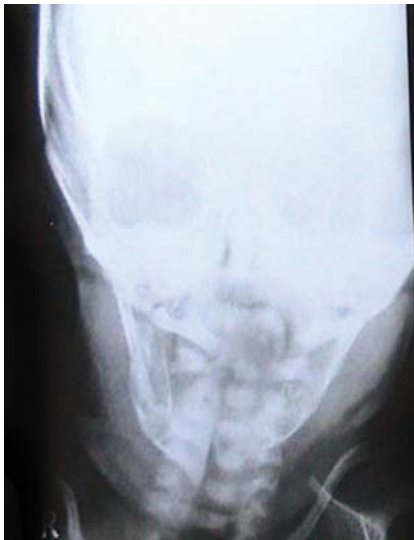
Fig. 1: Preoperative radiograph