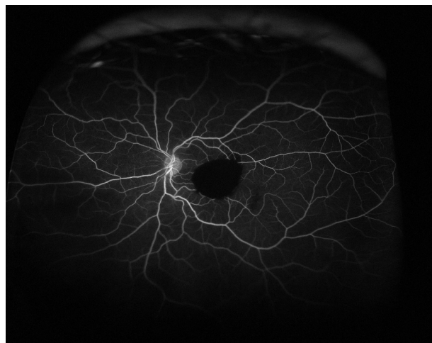
Figure 2 Fluorescein angiogram of the left eye shows blockage of fluorescein by the preretinal hemorrhage and no leakage is observed from the presumed location of the RAM.

Six weeks after PPV, she noted further visual improvement OS. Uncorrected VA measured 20/30 OD and 20/25 OS. Fundus examination OS revealed a small amount of dehemoglobinized blood adjacent to the arteriole and the