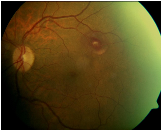
Figure 3 Two weeks status-post pars plana vitrectomy, a resolving RAM is visible along the superior-temporal arcades surrounded by resolving sub-retinal blood.

previous areas of intraretinal and subretinal hemorrhage were replaced by a circinate pattern of exudation. A FA was ordered to re-evaluate for leakage. Evaluation of the FA revealed a z-shaped kink in the involved arteriole at the site of the macroaneurysm without active leakage.