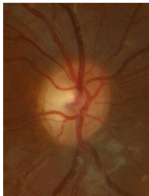
Figure 1 Optic disk temporal pallor after an episode of bilateral optic neuritis in a 13 years-old patient with a VA of 0.2 (decimal scale).

The diagnosis of optic neuritis is complex and may lead to frequent errors. 1 Optic neuritis of the adult is associated with autoimmune (Lupus erythematosus, sarcoidosis, Behçet's disease) and infectious diseases (viral etiology, syphilis, tuberculosis or Lyme disease). The differential diagnosis of optic neuritis also includes optic neuropathies of different etiologies such us compressive, ischemic, hereditary, toxic and nutritional.