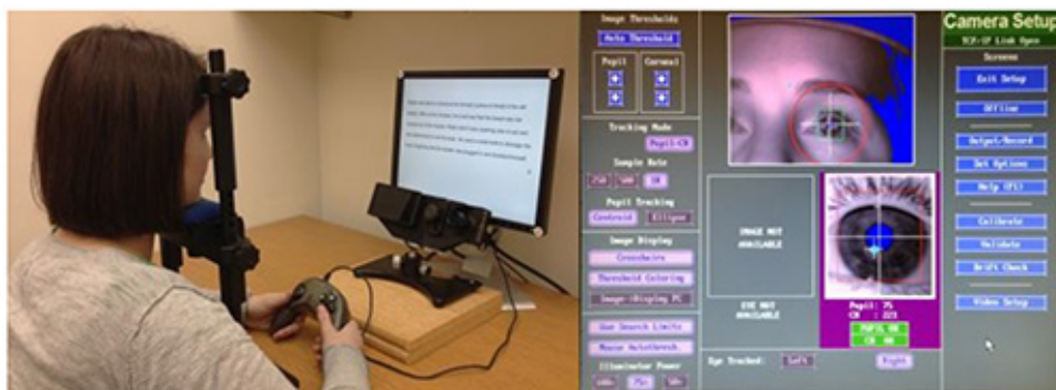
Figure 1. The left picture shows a participant positioned on the forehead/chin rest while looking at a computer display. The infrared light source and video camera are located beneath the display. The right picture shows the experimenter's display. The large image in the top frame shows the participant's face around the right eye (the eye being tracked) and the small image shows a close up of the right eye. The blue areas are areas of high infrared light reflection from the participant's hair (large image) and pupil (small image). The cross hairs over the eye identify the center of the pupil and the corneal reflection near the bottom of the pupil. Click here to view larger image.

The advantages of recording eye movements as opposed to reading times for an entire passage or sentence-by-sentence reading times can be seen in Figures 2 and 3 . For example, there are five fixations on the metaphor region ( Figure 2 ), three forward fixations and two regressive fixations, which reflect the reader reading through the metaphor to "doorway" and then returning (regressing) to "degree." In essence, the metaphor was read twice. This outcome would go unnoticed if only sentence reading times or overall reading times were measured. As a second example, Figure 3 shows that more time was spent reading the last word of the metaphor than the other three words in the metaphor, and that reading time was faster for familiar than unfamiliar metaphors for three of the four words in the metaphors. Measuring sentence-by-sentence reading times would indicate longer reading times for sentences containing familiar metaphors than unfamiliar metaphors, but it would be impossible to know if the extra reading time was distributed across all words in the metaphor or was confined to specific words, and how much time was spent on each word would be unknown. These two examples show the benefit of recording continuous, online reading behavior.