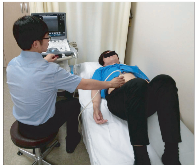
Fig. 1. Positioning of subjects during abdominal muscle measurement using ultrasonography.

Forty-seven hemiparetic stroke patients and 25 age-matched healthy control subjects participated in the current study. Twenty-six patients were right hemiparetic and 21 were left hemiparetic. The stroke patients were divided into three groups on the basis of their degree of ambulation, which was measured by the items of the Modified Barthel Index (MBI). The wheelchair ambulation group (group A, n=9) was defined as patients with a score of 1 to 5 in the wheelchair ambulation item. The assisted ambulation group (group B, n=23) had a score of 2 to 3 in the ambulation item and the independent ambu-