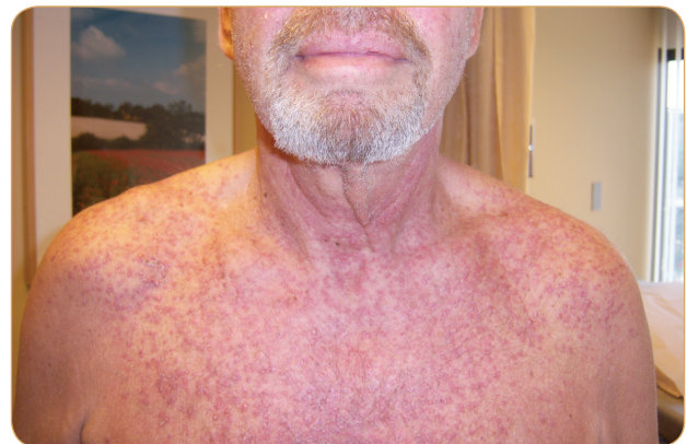
Figure 1. Papulopustular rash from erlotinib.

Papulopustular rash appears in up to 80% to 90% of patients, with mild to moderate severity (Lacouture et al., 2011; Burtneess et al., 2009; Per-