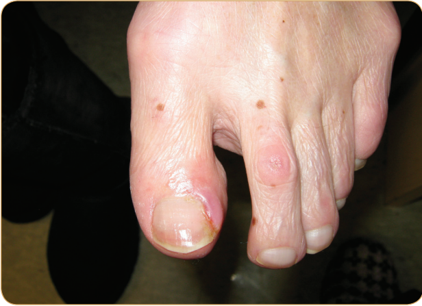
Figure 2. Paronychia from cetuximab.

has been recommended; the use of systemic doxepin may be effective in reducing itching in some patients (Lacouture et al., 2011).