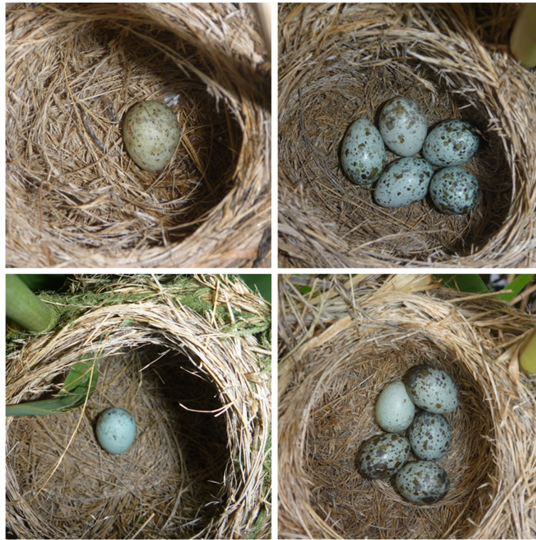
Figure 3 Representative nests of great reed warblers with natural common cuckoo parasitism: two nests parasitized in the pre-egg laying stage (on the left), and two nests with cuckoo eggs in complete clutches (on the right). In the latter nests the cuckoo egg is in the middle of the top positions (above), and in the left top position (below).

following the method of [61], based on [62], as second year (young, first time breeder) or after second year (older breeder).