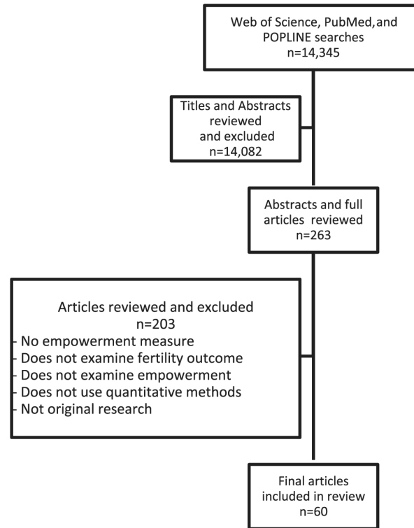
Fig. 1. Flow chart of literature search.