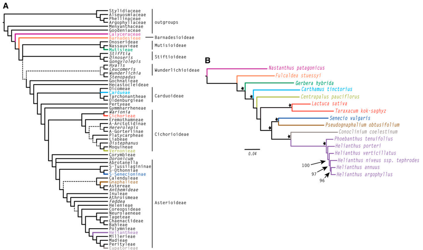
Fig. 1. Compositae base tree and COS loci tree. (A) Summary of 10-locus chloroplast tree for ca. 900 genera redrawn from Funk et al. (2009). (B) Maximum likelihood tree based on 763 COS loci. Species sampled in our study are colored the same as their tribe in (A). Bootstrap values greater than 75% are indicated with a star. Bootstraps for the Heliantheae-only data set are given in numeric values with arrows. Note that within the Heliantheae-only data set, Phoebanthus was used as the outgroup so no support value is given for the node distinguishing it and the Helianthus species.