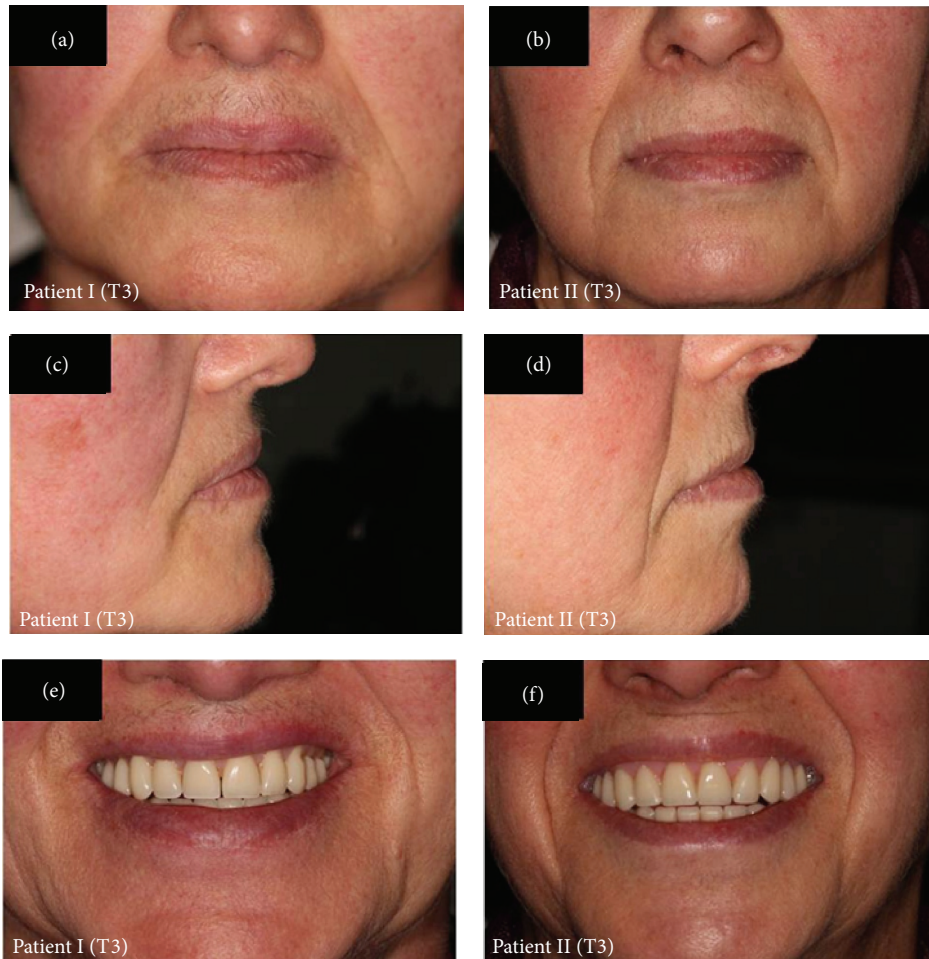
FIGURE 3: Images of clinical conditions of patients I and II after 4 years of rehabilitation or T3. (a) Resting posture of patient I. (b) Resting posture of patient II. (c) Facial profile of patient I. (d) Facial profile of patient II. (e) Smile of patient I. (f) Smile of patient II.