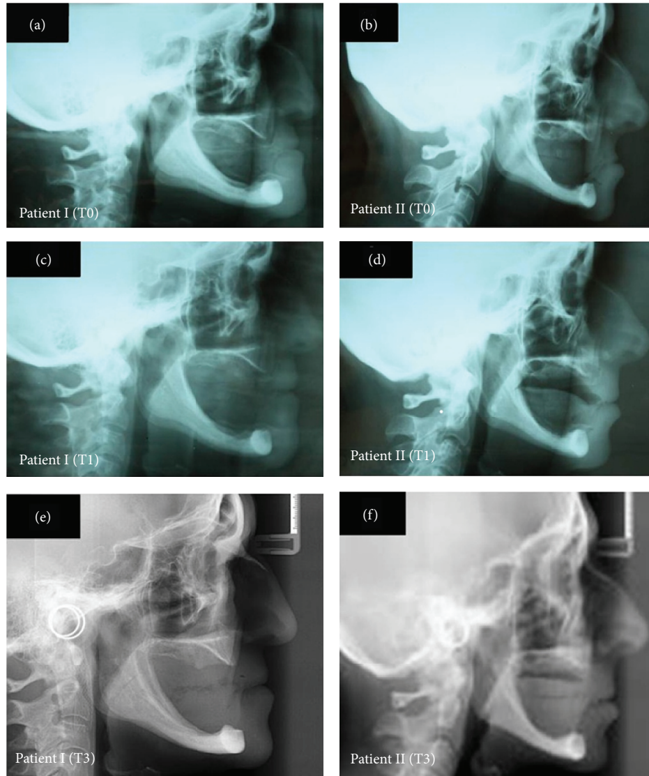
FIGURE 2: Lateral cephalometric radiograph of patients. (a) Patient I at baseline or T0. (b) Patient II at baseline or T0. (c) Patient I at trial insertion or T1. (d) Patient II at trial insertion or T1. (e) Patient I after four years of rehabilitation or T3. (f) Patient II after four years of rehabilitation or T3.

skeletal details, although the use of soft tissue references can also be used to define the face length [13, 14].