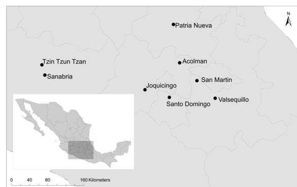
Figure 1. Datura stramonium populations sampled in Central Mexico (See Table S1).

We used HPLC to quantify the concentration of atropine and scopolamine (two major alkaloids in D. stramonium ) from a sample of 20 leaves per plant. The extraction method consisted of a series of acid-base reactions (see [32]). The samples were injected into a Waters Alliance 2695 HPLC device. We used a reverse-phase column (Discovery C-18 Supelco Analytical) at 30°C. The injection volume was 30 \mu L with a flow rate of 1 mL/min. The mobile phase was a solution of acetonitrile, methanol and a 30 mM phosphate buffer at a pH of 6.00 (9:6.9:84.1, v/v/v). The DAD detector used a wavelength of 210 nm. The curves obtained from each sample were compared against a standard solution of atropine and scopolamine (Sigma-Aldrich Laboratories, 1 mg/mL). The mean alkaloid